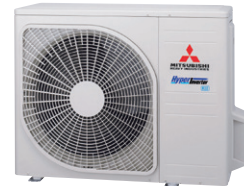
SRC40ZSX-W1, SRC50ZSX-W2, SRC60ZSX-W1